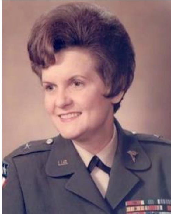
Brig. Gen. Anna Mae Hays became the first woman and the first nurse in American military history to attain the rank of general officer.

Retired Brig. Gen. Anna Mae Hays, 97: The Army officer was the first female general in U.S. history, and the first nurse in the U.S. military to reach that rank. She led the Army Nurse Corps and worked toward changes to open opportunities for women to serve in uniform. Hays served in Burma, China and India during World War II and helped set up the first military hospital during the Korean War. Jan. 7.