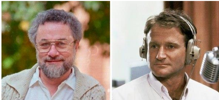
Adrian Cronauer, left, was a disc jockey at the Saigon-based Dawnbuster radio show from 1965-1966. He is shown in 1987. His experiences in the Vietnam War were portrayed in the movie, "Good Morning, Vietnam," with actor Robin Williams as Cronauer.