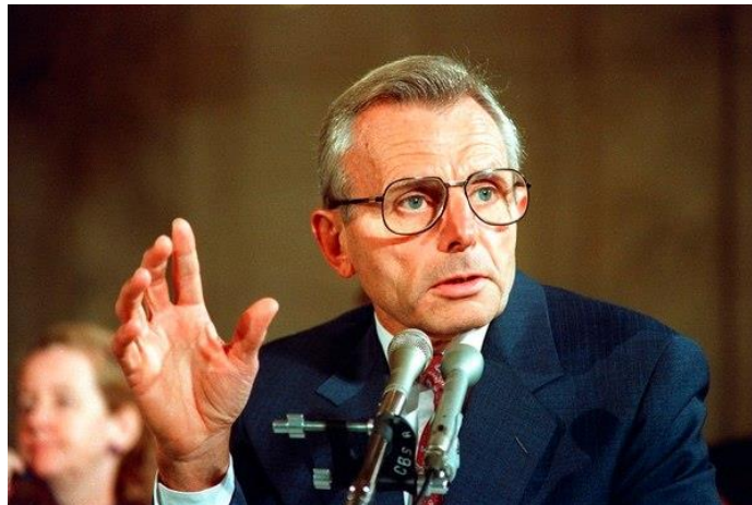
In this July 13, 1988, file photo, U.S. Defense Secretary Frank Carlucci testifies at the Senate Armed Services Committee on Capitol Hill in Washington. Carlucci, a Navy veteran and former diplomat who served as secretary of defense during the final 14 months of President Ronald Reagan's second term, died in June 2018 at age 87.

Frank C. Carlucci III, 87: He served as secretary of defense under President Ronald Reagan, capping a career that began in diplomacy. He was a “transformative leader” who managed critical defense issues and rebalanced priorities during challenging times, said Defense Secretary Jim Mattis. At the Pentagon, Carlucci faced crises in the Persian Gulf such as the USS Vincennes shooting down a civilian Iranian airliner, killing 290 people, in 1988. After leaving the Pentagon, he held executive positions at an investment group. June 3.