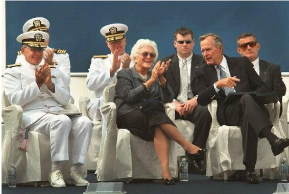
President George H.W. Bush and former first lady Barbara Bush join Adm. Vern Clark, chief of naval operations, on Aug. 26, 2003, as they watch the Navy's parachute team The Leapfrogs perform during a keel laying ceremony for the aircraft carrier George H.W. Bush.

President George H.W. Bush, 94: As a young Navy pilot, he flew 58 missions and in World War II he was shot down over the Pacific. He later served as a congressman, director of the CIA, and spent eight years as vice president under President Ronald Reagan. He was elected president in 1988 and was defeated four years later in his bid for re-election. In later years he worked toward humanitarian causes, raising funds for disaster relief and forming a partnership with the man who defeated him in his final bid for president, Bill Clinton. He died months after his wife of more than 70 years, former first lady Barbara Bush , who died in April 17 at age 92. Nov. 30.