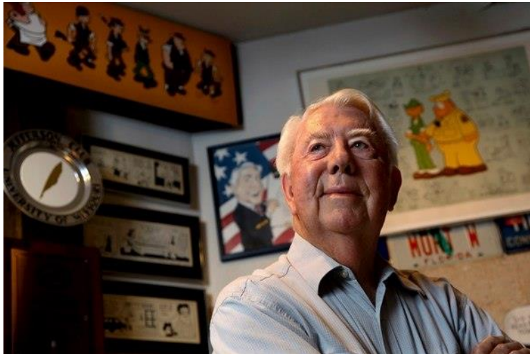
Mort Walker , the artist and author of the Beetle Bailey comic strip, stands in his studio in Stamford, Conn., in this Aug. 16, 2010, photo. Walker died Jan. 27, 2018. He was 94.

Retired Brig. Gen. Anna Mae Hays, 97: The Army officer was the first female general in U.S. history, and the first nurse in the U.S. military to reach that rank. She led the Army Nurse Corps and worked toward changes to open opportunities for women to serve in uniform. Hays served in Burma, China and India during World War II and helped set up the first military hospital during the Korean War. Jan. 7.