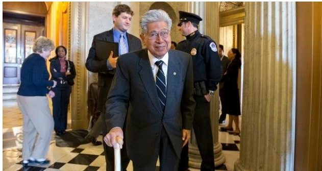
In this Dec. 12, 2012, file photo, Sen. Daniel Akaka, D-Hawaii, the first Native Hawaiian to serve in the Senate, leaves the Senate chamber on Capitol Hill in Washington after delivering his farewell speech. Akaka, known as a humble and gracious statesman who served in Washington with aloha for three and a half decades, died Thursday, April 5, 2018, at the age of 93.

Sen. Daniel Kahikina Akaka, 93: The World War II veteran was the first Native Hawaiian in Congress , and he served there for more than three decades, first in the House and later in the Senate. He was in the Army Corps of Engineers during WWII and later became an advocate for veterans, introducing measures to improve services to vets and speaking out about their need for attention to all their wounds, both seen and unseen. Akaka, a Democrat, sponsored federal legislation that led to Medals of Honor for 22 Asian-American soldiers who fought during WWII, including the late Sen. Daniel Inouye. In 2012, Akaka chose not to run for re-election and he left the Senate the next year. April 6.