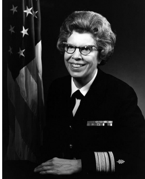
Official portrait of Rear Adm. Alene B. Duerk. The first woman to attain the rank of admiral passed away in July at the age of 98.

Retired Rear Adm. Alene Duerk, 98: She was a trailblazer as the Navy's first female admiral . Duerk trained as a nurse and in her early tours she served as a ward nurse at Naval Hospital Portsmouth, Virginia. She served at sea on the USS Benevolence and in 1945 she tended to wounded troops returning from fighting in World War II. In 1970, Duerk was named director of the Navy Nurse Corps, and she worked to expand Navy medical capabilities in a number of specialties. Duerk retired in 1975 but stayed involved in Navy medicine for many years afterward. July 21.